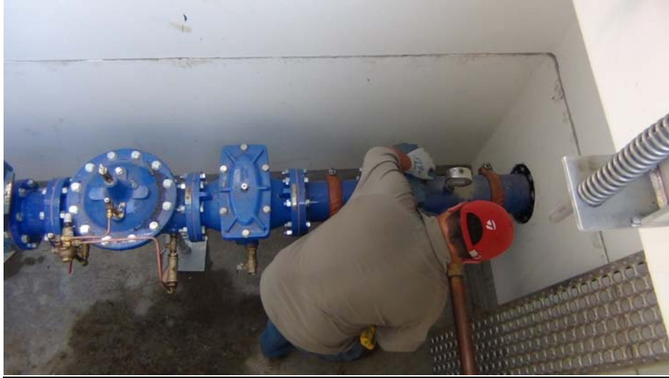
2011 PVR Vault Installation