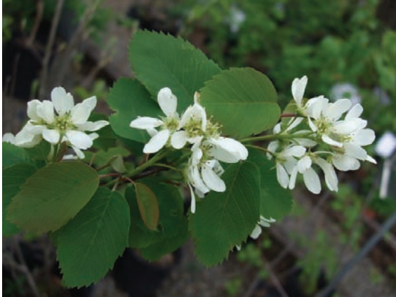
Pacific Serviceberry, Amelanchier alnifolia Native to all of Washington, great landscaping plant and also produces edible berries!